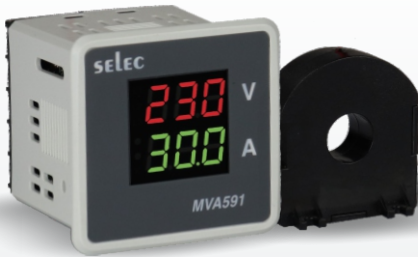
48 x 48mm